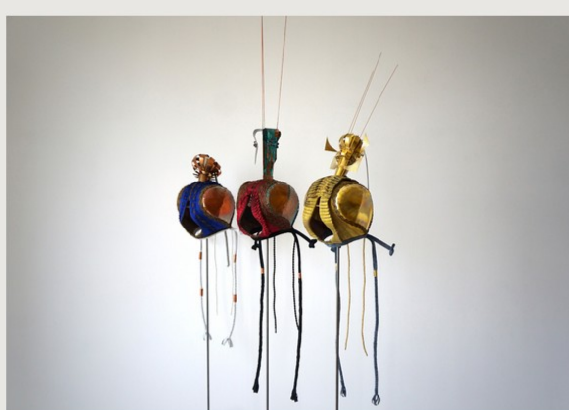
Patrizia Ruthensteiner, Falconry Hoods dimensioned for humans with sounding crowns , 2019/20